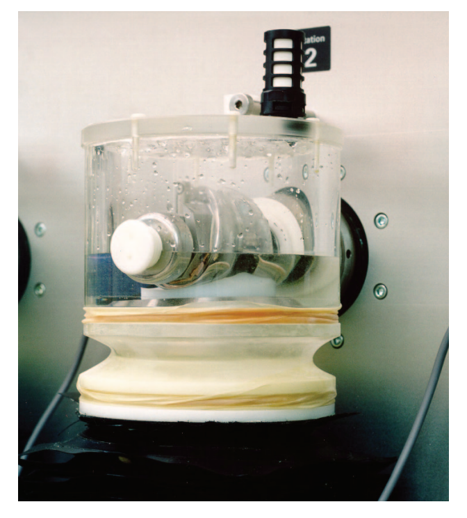
Optional High Displacement Fixturing